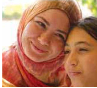
Recently naturalized U.S. citizens

HCC Life Short Term Medical (STM) provides affordable temporary health insurance to protect you and your family. You should consider purchasing HCC Life STM if you are concerned about protecting yourself from the potentially high medical costs associated with an unexpected sickness or injury.