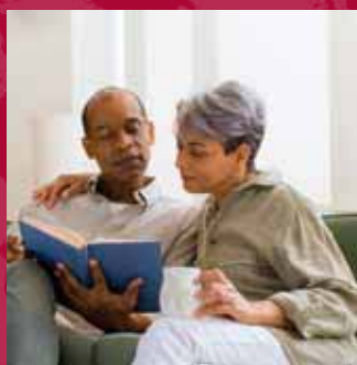
WAITING FOR MEDICARE COVERAGE