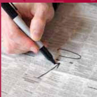
TRANSITIONING BETWEEN JOBS