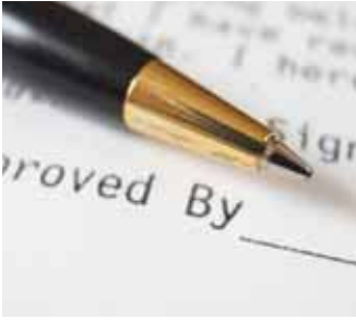
Waiting for major medical